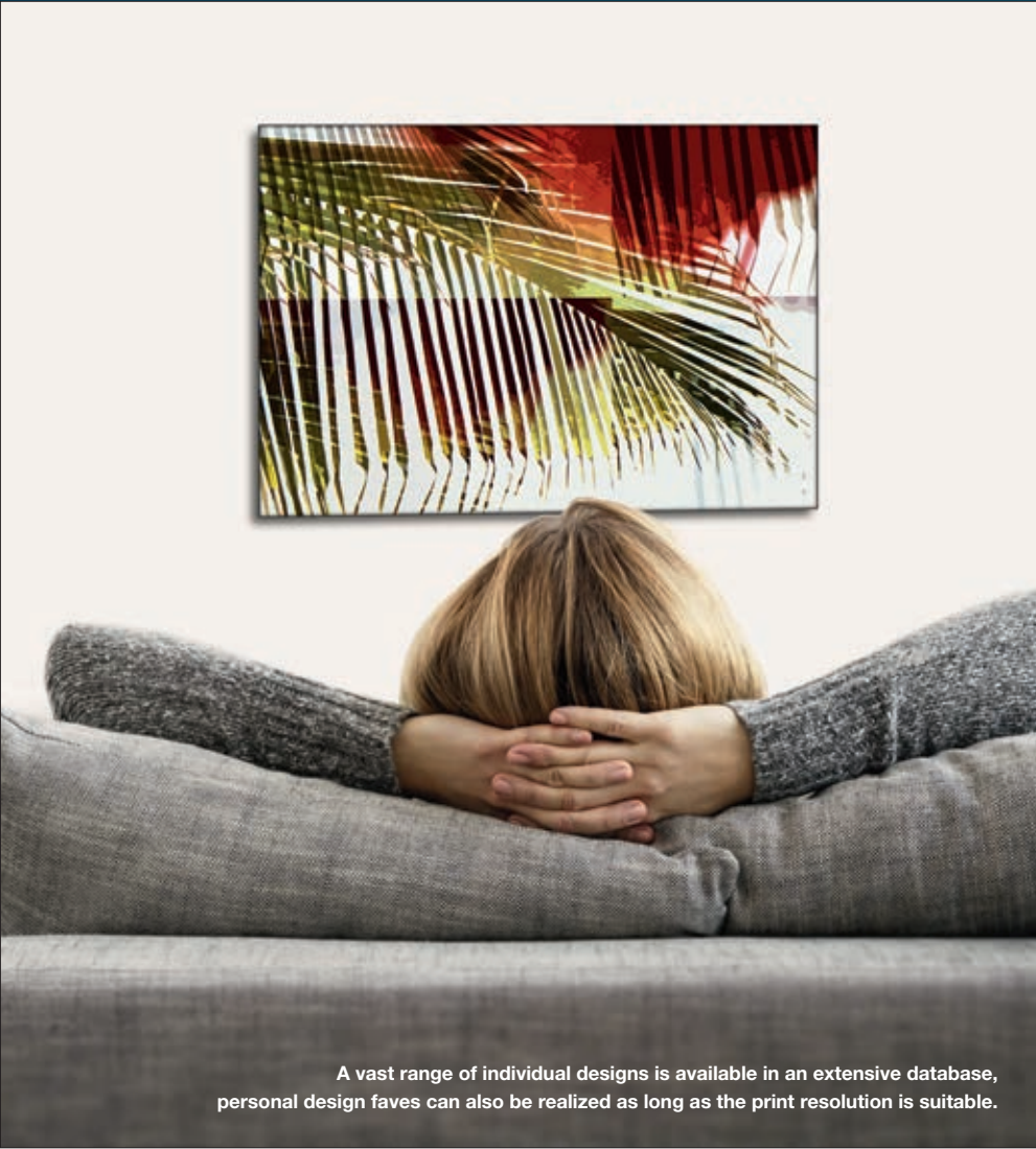
A vast range of individual designs is available in an extensive database, personal design faves can also be realized as long as the print resolution is suitable.